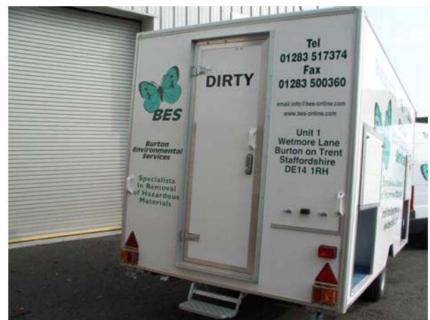
Purpose built hygiene facilities used by BES