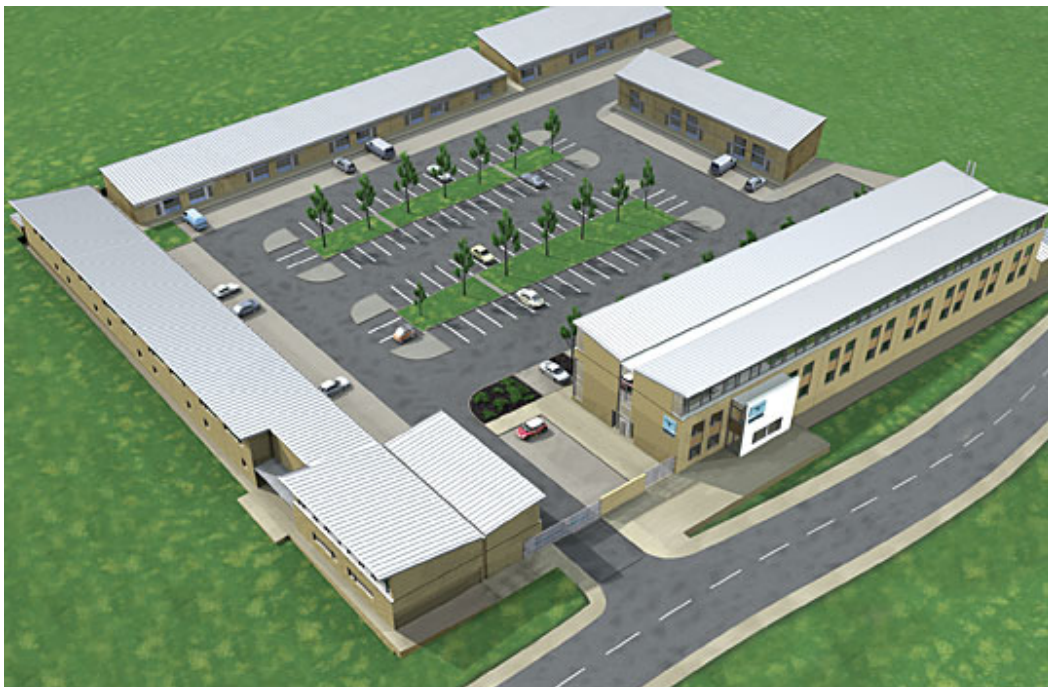
Kestrel Court, Portishead, Bristol