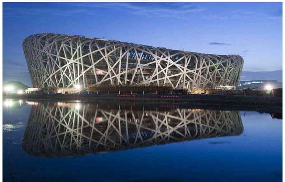
Olympic "bird's nest" Stadium, Beijing.

The announcement made on July 13, 2001 by the International Olympic Committee that Beijing had been elected as the Host City for the 2008 Olympics set alarm bells ringing in the IBAS office. Knowing that China is the world's largest consumer of asbestos, we wondered whether the "Green Olympics," as they were being promoted, would be constructed with white asbestos?